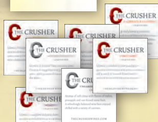
Varietal Shelf Talkers