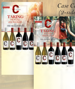
Case Card (2-sided)