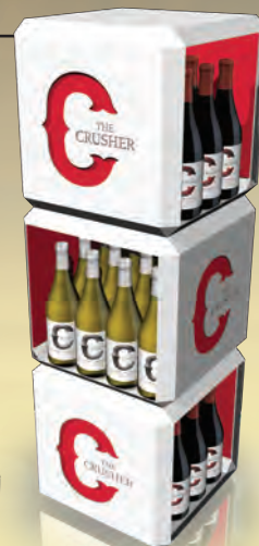
Cube Display (holds 4 cases)